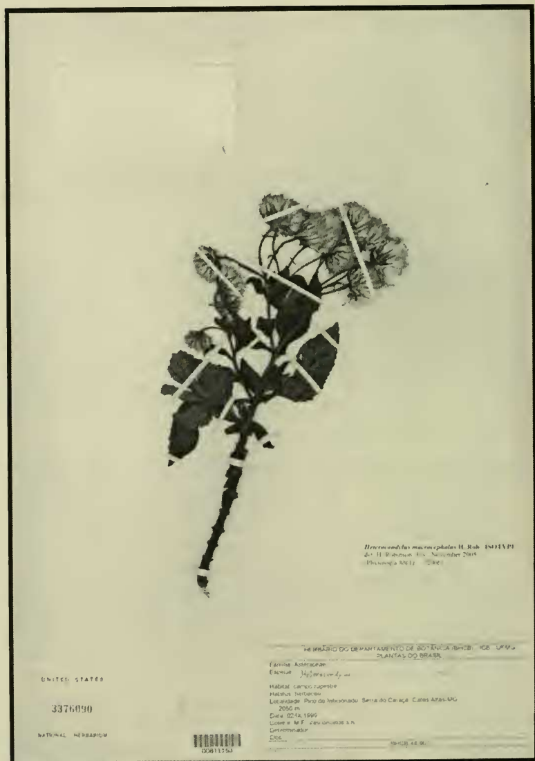
Fig. 5. Heterocondylus macrocephalus H. Robinson, isotype, United States National Herbarium (US).